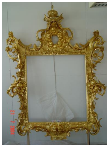
Figure 26. General view of the frame for the temple icon Nicholas the Wonderworker in Life in the assembly after a comprehensive restoration of the base and decorative decoration in the form of gilding