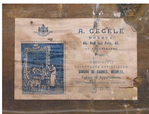
Figure 19. The label of the company A. Jessel, discovered during the restoration of the frame to the temple icon Nicholas the Wonderworker in Life in 2004