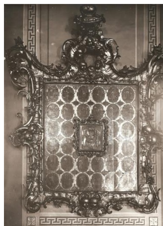
Figure 6. The frame and the temple icon Nicholas the Wonderworker in the Life of the Sampson Cathedral after the restoration of 1909.