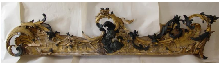
Figure 42. The left listel of the frame to the icon Mikhail Malein and John the Warrior in the process of modeling the loss of carved and ornamental decor