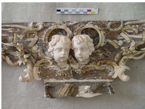
Figure 17. The fragment is the center of the lower listel of the frame to the temple icon Nicholas the Wonderworker in Life after the preservation of historical levkas and gilding, after the restoration of the loss of ornamental and sculptural wood carving