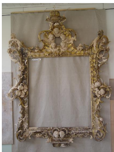
Figure 25. General view of the frame for the temple icon Nicholas the Wonderworker in Life in the assembly after a comprehensive restoration of the foundation and the reconstruction of ornamental and sculptural decor. preservation of historical levkas with gilding and partial clearing of the surface of historical gilding from strong persistent surface contamination