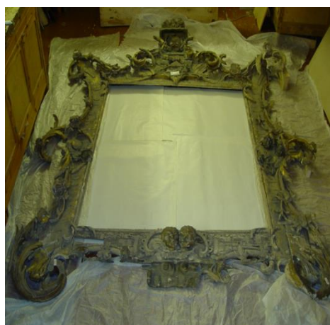
Figure 8. The frame for the icon Nicholas the Wonderworker in Life before the restoration of the foundation in the process of disassembling the disparate elements of the frame and identifying their historical places in the composition in the restoration workshop of wood carvers