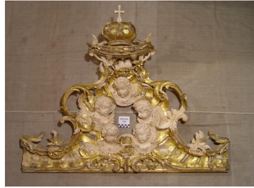
Figure 10. The upper listel of the frame to the temple icon Nicholas the Wonderworker in Life after recreating the loss of sculptural and ornamental decor in the authentic material of the monument – linden wood