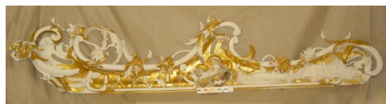
Figure 23. The right listel of the frame to the temple icon Nicholas the Wonderworker in Life in the process of preserving the historical levkas and local reconstruction of its losses, with clearing the surface of persistent contamination of historical gilding