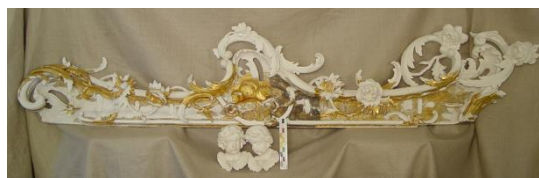
Figure 21. The left listel of the frame to the temple icon Nicholas the Wonderworker in Life in the process of preserving the historical levkas and local reconstruction of its losses with the control clearing of the surface from intense persistent contamination (in the center) from the historical gilding of 1909