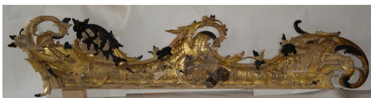
Figure 43. The left listel of the frame to the icon Mikhail Malein and John the Warrior in the process of modeling the loss of carved and ornamental decor