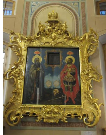
Figure 46. General view of the temple icon Mikhail Malein and John the Warrior in the frame after a comprehensive restoration of carved ornamental and sculptural decor with restored gilding of two types