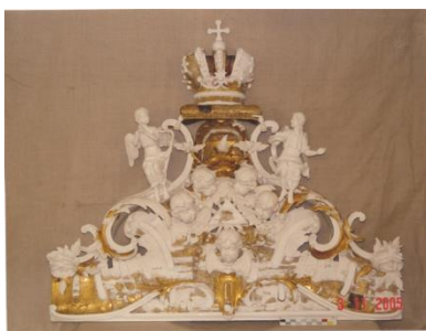
Figure 40. The upper listel of the frame to the temple icon Mikhail Malein and John the Warrior after the restoration of the loss of carved and sculptural decoration, preservation of the historical ground with gilding, local reconstruction of the lost ground-levkas