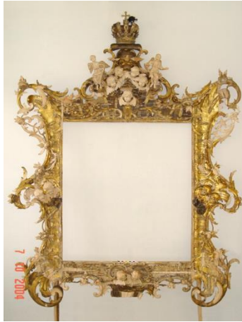
Figure 45. General view of the frontside of the frame to the temple icon Mikhail Malein and John the Warrior in the process of restoration - restoration of carved and sculptural decor and preservation of the historical levkas with gilding in 1909