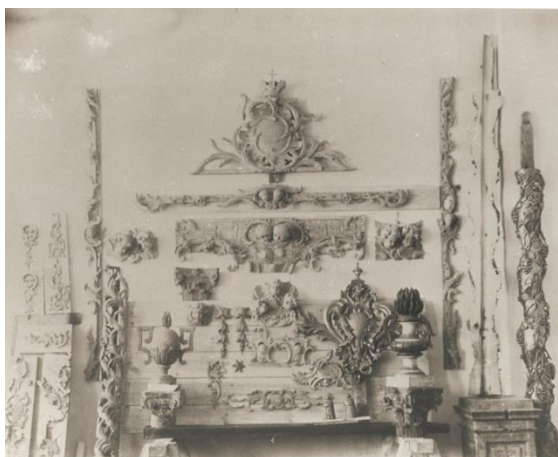
Figure 5. Details of the frames for the temple icons and the altar Canopy of the Sampson Cathedral in the process of restoration in the workshop of A. Zheselya. 1908.