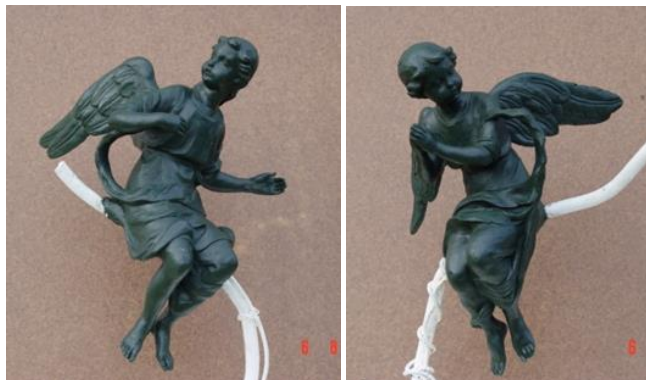
Figure 37-38. Reconstruction based on a photograph of two sculptures of angels made in a soft material-plasticine for the upper listel of the frame for the temple icon Mikhail Malein and John the Warrior