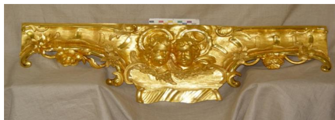
Figure 16. The lower listel of the frame to the temple icon Nicholas the Wonderworker in Life after a full complex of conservation and restoration work