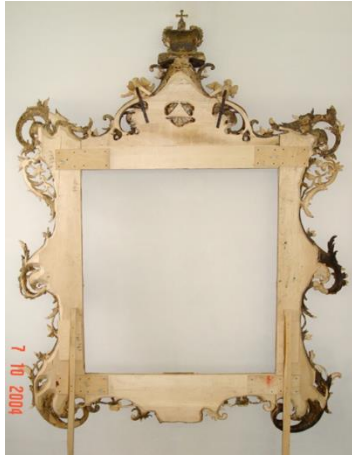
Figure 44. General view of the backside of the frame to the temple icon Mikhail Malein and John the Warrior in the process of duplicating the base and dry assembly of the frame