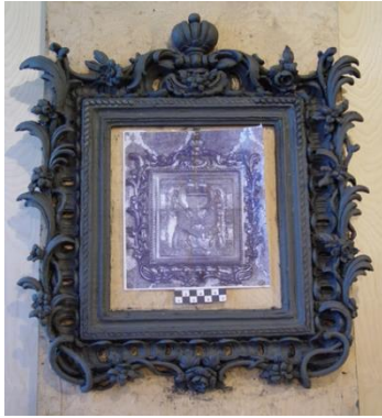
Figure 27. Reconstruction of the lost small frame to the image of Nicholas the Wonderworker of the 17th century based on the photograph of K.K. Bulla in 1909. Execution of the model in a soft material