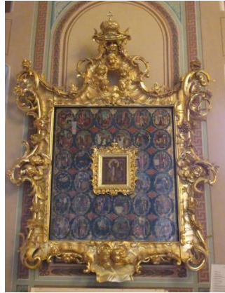
Figure 34. The frame for the temple icon after a comprehensive restoration of the base and decoration in the form of decorative combined gilding and reconstruction of the lost frame to the image of Nicholas the Wonderworker of the 17th century