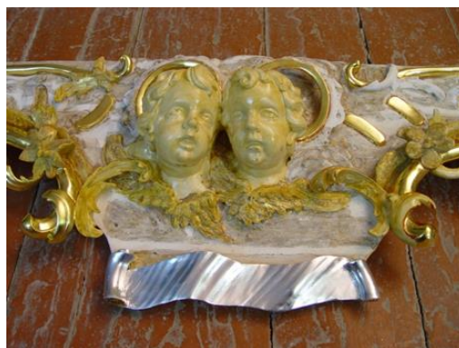
Figure 18. The fragment is the center of the lower listel of the frame to the temple icon Nicholas the Wonderworker in Life in the process of recreating the decorative decoration with a silver gilt lining on the ribbon, as an analogue of the historical decoration