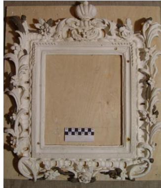
Figure 28. The transfer of the model from soft material to plaster to continue working in the authentic material of the monument – the wood of the linden tree