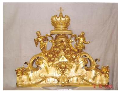
Figure 41. The upper listel of the frame to the temple icon Mikhail Malein and John the Warrior after the restoration of the loss of carved and sculptural decoration, local recreation of the levkas and locally decorative gilding: glossy on a polymer and matte, with tinted restoration gilding to match the color of the preserved historical