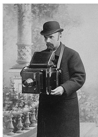
Figure 4. Karl Karlovich Bulla - portrait painter and master of documentary photography, hereditary honorary citizen of St Petersburg (1855-1929)