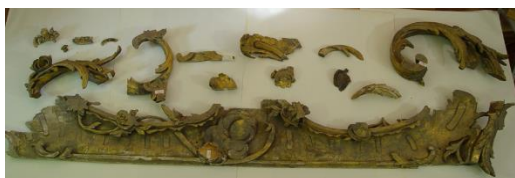
Figure 20. The left listel of the frame to the temple icon Nicholas the Wonderworker in Life before the restoration of the base loss with characteristic strong persistent surface contamination of the base and historical gilding when identifying the loss of the composition