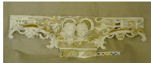
Figure 15. The lower listel of the frame to the temple icon Nicholas the Wonderworker in Life after the preservation of the historical runt, local replenishment of its losses and removal of persistent surface contamination