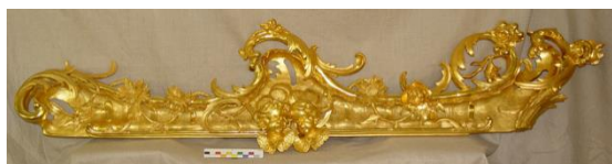
Figure 22. The left listel of the frame to the temple icon Nicholas the Wonderworker in Life after the preservation of the historical levkas, the local reconstruction of its losses and the local reconstruction of decorative gilding of two types