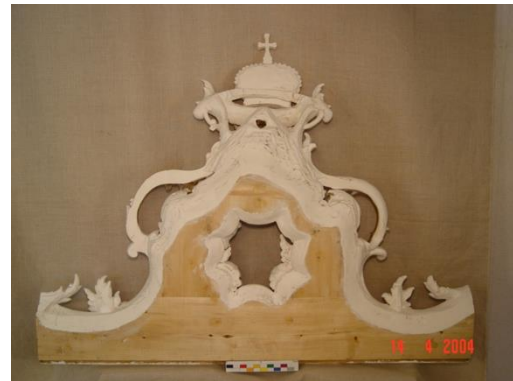
Figure 12. The back side of the upper leaf of the frame of the temple icon Nicholas the Wonderworker in Life in the process of dubbing historical fragments on a new basis and the process of recreating the lost ground-levkas