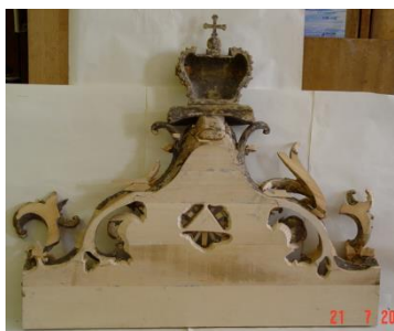
Figure 39. The backside of the upper listel of the frame to the temple icon Mikhail Malein and John the Warrior after duplicating the original carving of the 18th century on a new foundation