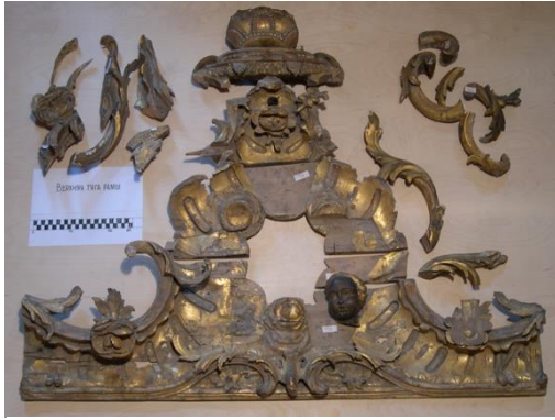
Figure 9. The upper listel of the frame to the temple icon Nicholas the Wonderworker in Life before the restoration of the foundation was lost in the process of identifying their historical places in the composition of the upper leaflet of the frame