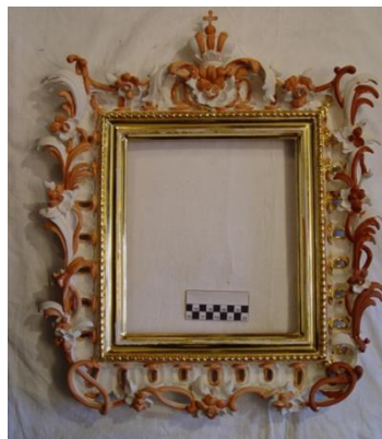
Figure 30. Reconstruction of the ground-levkas on the recreated frame to the image of Nicholas the Wonderworker of the 17th century. Application of primer-polymer to the places of glossy gilding