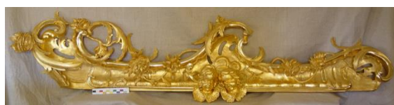
Figure 24. The right leaflet of the frame to the temple icon St. Nicholas the Wonderworker in Life after the preservation of the historical gilt frame, local soil replenishment, the restoration of two types of gilding and tinting of the restoration gilding to match the color of the preserved historical