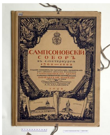
Figure 3. Anniversary album about the restoration of the Sampson Cathedral in 1908-1909, published for the 200th anniversary of the Victory in the Battle of Poltava in 1709