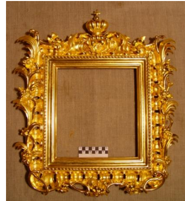
Figure 32. The execution of glossy gilding on the polymer and matte on the codpiece, followed by toning of the restoration gilding on the recreated frame to the image of Nicholas the Wonderworker of the 17th century to match the color of the icon Nicholas the Wonderworker in Life preserved on the large frame