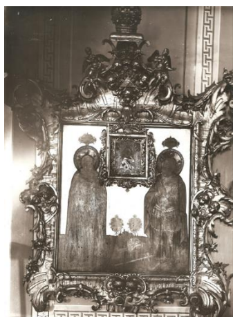
Figure 7. The frame and the temple icon Mikhail Malein and John the Warrior of the Sampson Cathedral before the restoration of 1909.