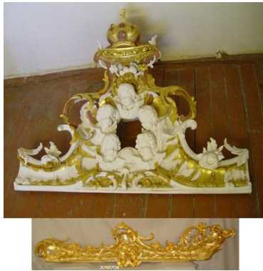
Figure 11. The upper listel of the frame to the temple icon "Nicholas the Wonderworker in life during restoration: local reconstruction of the loss of levkas and removal of persistent surface contamination with preservation and preservation of the historical gilding of 1909