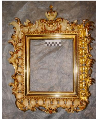
Figure 31. The execution of glossy gilding on a polymer on a recreated frame to the image of Nicholas the Wonderworker of the 17th century and the coating of areas of future matte gilding with alcohol shellac varnish