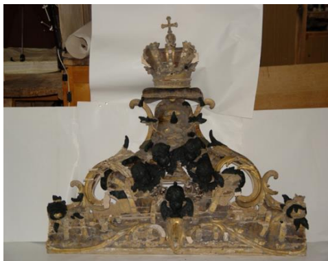
Figure 36. The upper listel of the frame to the temple icon Mikhail Malein and John the Warrior before the restoration of the losses of carved and sculptural decor with losses made up in soft material-plasticine