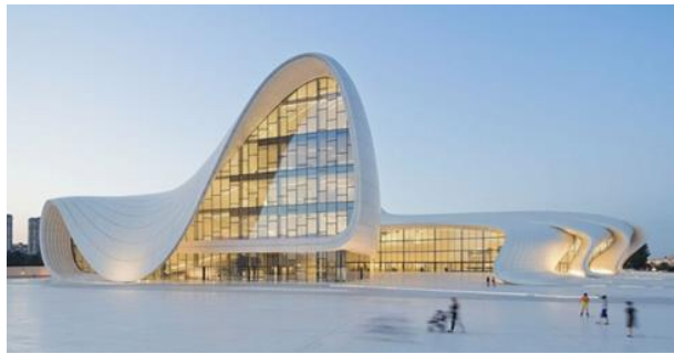
Figure 10. Heydar Aliyev Cultural Center in Baku. Zakha Khadid