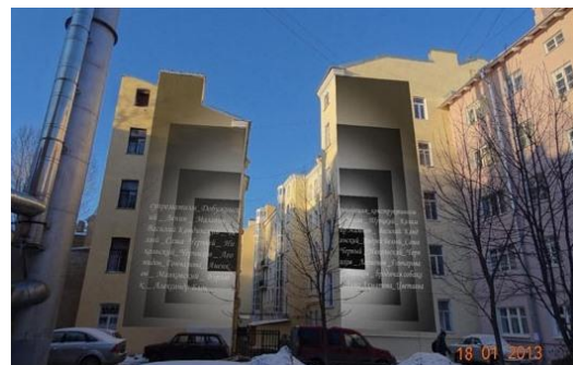
Figure 6. Super Square. St. Petersburg. A.V. Dobrodeev