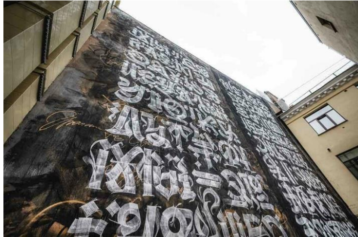
Figure 8. Dualism. St. Petersburg. Pokras Lampas