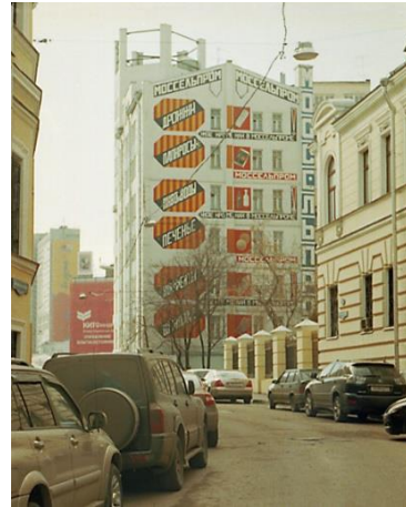
Figure 2. Advertising of Mosselprom. A. Rodchenko