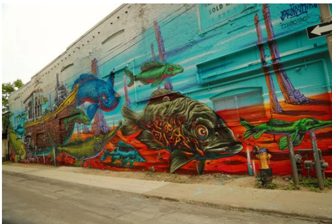
Figure 3. Bruno Smoky, Canada