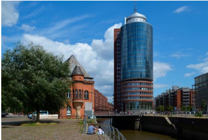
Figure 1. The building in Hamburg