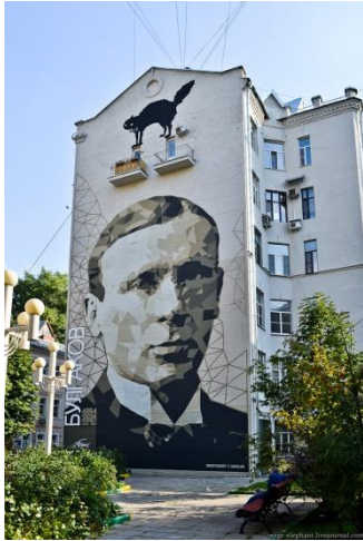
Figure 7. Zuk Club, M. Bulakov. Moscow.