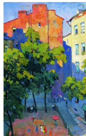
Figure 4. Yard. Ya. I. Krestovsky