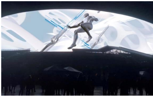
Figure 9. "Oscillation. Shards". Ak Bars Arena Stadium. NUR, International Media Art Festival, 2021 (Kazan). Meta Rite