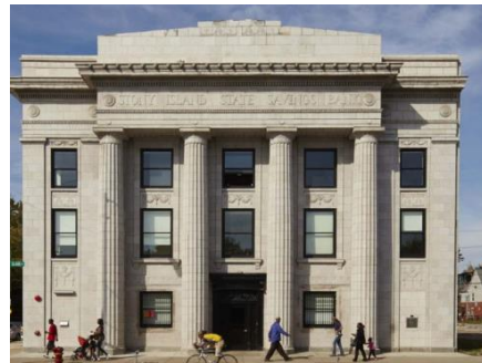
Figure 4. Stony Island Arts Bank in Chicago, revitalized by Rebuild Foundation