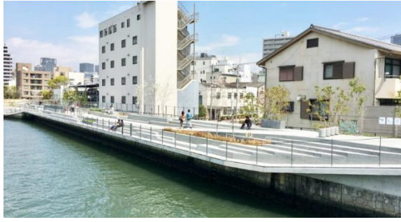
Figure 7. TocoTocoDandan: Flood Defense as Waterfront Public Space in Osaka, revitalized by Ryoko Iwase