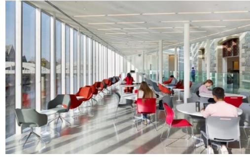
Figure 8. Idea Exchange Old Post Office in Cambridge, revitalized by RDHA