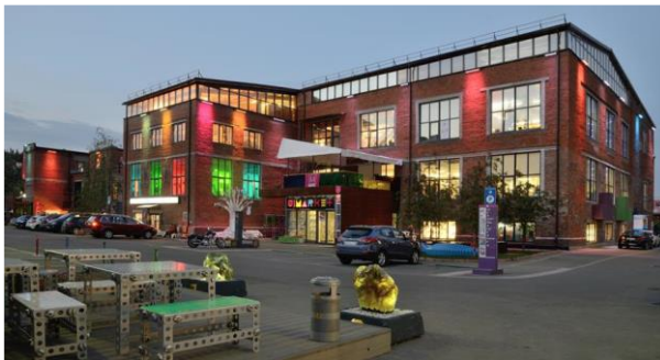
Figure 3. Design plant “Bottle” on the site of the Crystal Factory named Kalinin after a complex of revitalization works