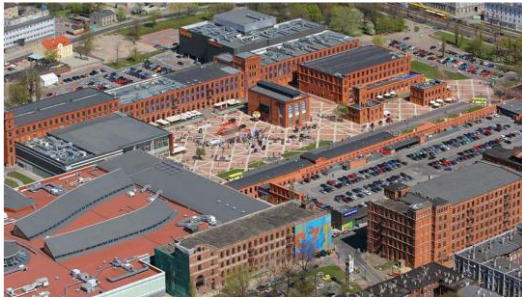
Figure 1. Ex-industrial complex “Manufaktura” in Lodz (Poland) after the revitalization activities