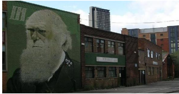
Figure 2. Sheffield cultural industrial quarter (old industrial complex after revitalization)