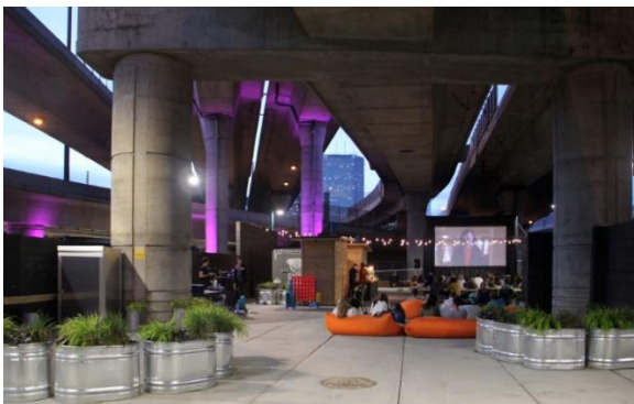
Figure 5. Infra-Space 1 in Boston, revitalized by Landing Studio