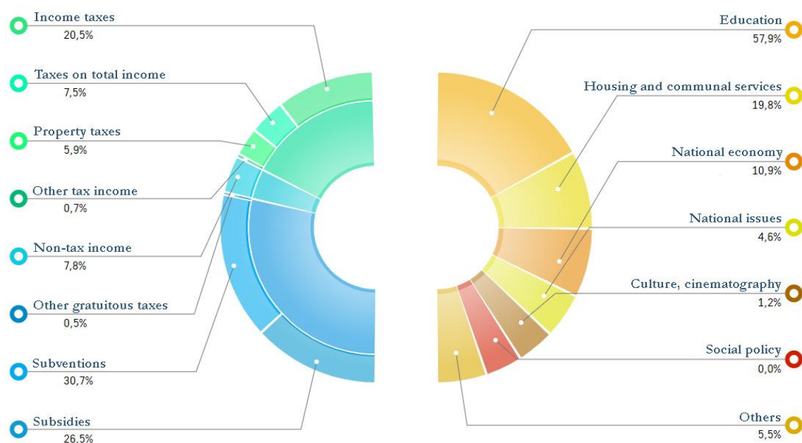
Figure 3. The structure of expenditures of the Nizhny Novgorod budget for 2021