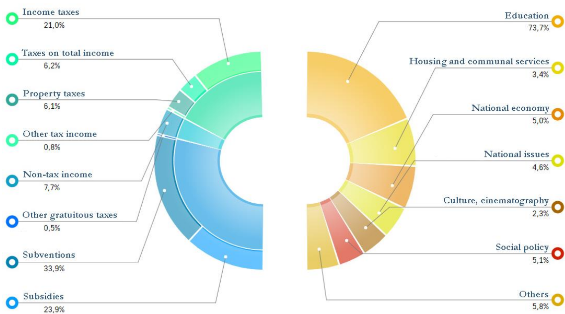
Figure 4. The structure of expenditures of the Nizhny Novgorod budget for 2022