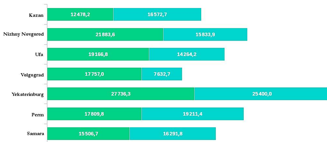
Figure 5. Comparison of budget revenues of million-plus cities for 2020